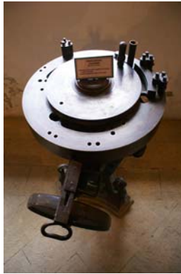
GRAFILADORA a historic piece of Bolivian mining equipment used to polish the edge of a coin.

The foundation’s goal is to leverage the success of the San Bartolome Mine for the benefit of the local community. FUNDESPO’s focus is to foster development of the local Bolivians’ trades and to provide vital contributions to help sustain Bolivia’s long-term economic goals through promoting tourism development, preservation of historical and cultural heritage, health and education projects in Potosi.