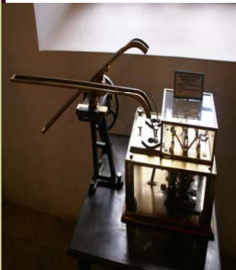
BALANZA DE PRECISION a historic piece of Bolivian mining equipment used to control the exact weight of the coins.